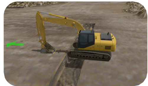
Trench Crossing using Boom Jacking