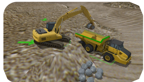
Truck spotting with an interactive, articulated dump truck